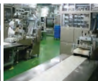
To kill bacteria on food processing machines