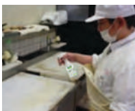
To kill bacteria on cooking tools