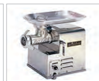
To kill bacteria on meat choppers