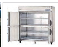
To kill bacteria and odor inside the refrigerators and handrails