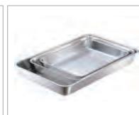
To kill bacteria on trays