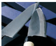
To kill bacteria on kitchen knives and cooking tools