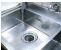
To kill bacteria on sinks